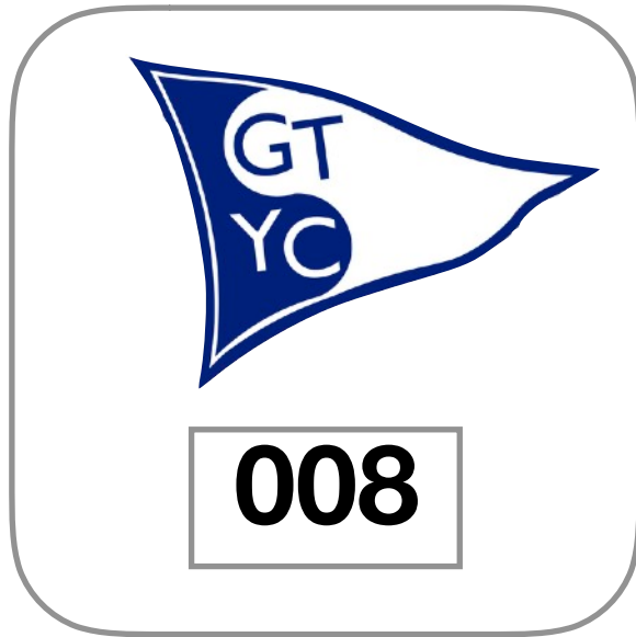
Active Member Tag