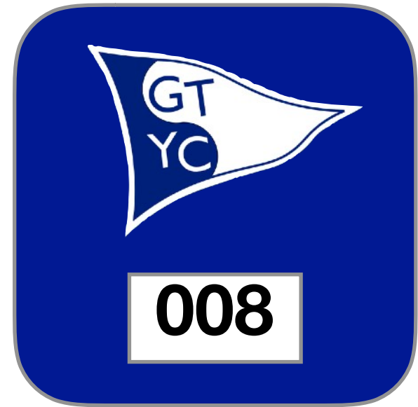
Associate Member Tag